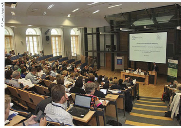
The 6th EUA-CDE Annual Meeting at the University of Warsaw

EUA's work on doctoral training and research careers in the context of the MoU went hand in hand with the activities of the Council for Doctoral Education , which had a particularly successful year. Its members gathered at the Politecnico di Torino for a thematic workshop on interdisciplinary doctoral programmes in January, while representatives from some