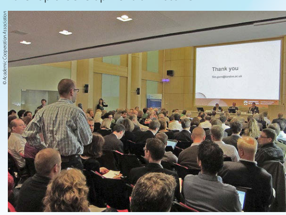
ACA-EUA MOOCs Seminar in Brussels

In a further attempt to capture the present rapid changes taking place in teaching and learning, EUA also launched an online survey to map capacities