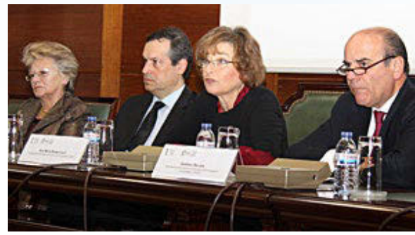
Presentation of the report: Portuguese Higher Education. A view from the outside

education and research. At the request of the Portuguese Rectors' Conference, EUA assembled European experts with a view to appraising the Portuguese HE system, identifying challenges and making recommendations. The report, published in