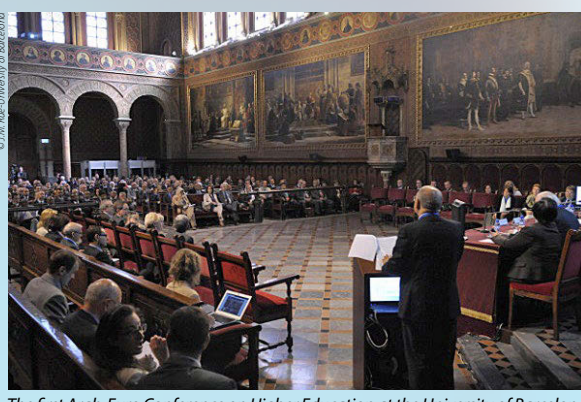
The first Arab-Euro Conference on Higher Education at the University of Barcelona

In the spring, the association co-organised two important dialogue events. The EU-China Presidents dialogue , held in the framework of the European Commission and the Chinese Government's