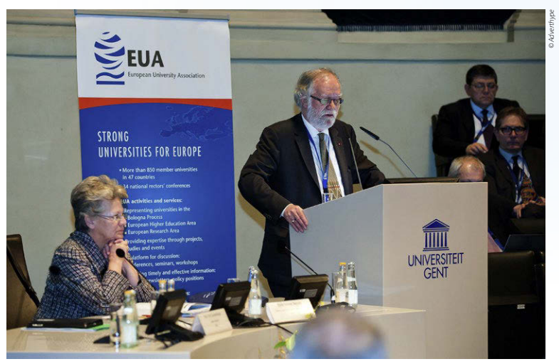
The EUA General Assembly at Ghent University in April 2013

The 2013 EUA General Assembly (GA) took place in Ghent prior to the Annual Conference.