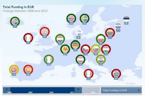
EUA Public Funding Observatory Tool

In June, EUA released the latest edition of its Public Funding Observatory report which monitors the impact of the economic crisis on universities and identifies trends in public funding to higher education institutions. The 2013 report was launched in tandem with a new interactive online tool