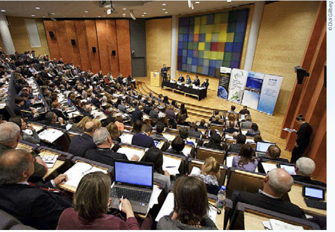
The 8th EQAF at the University of Gothenburg

The E4 Group also organised in November the 8<sup>th</sup> European Quality Assurance Forum (EQAF) at Gothenburg University, which brought together more than 400 higher education stakeholders to discuss the latest developments and trends in quality assurance (QA). Centred